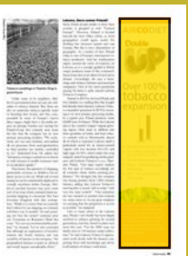
1/3 page Vertical 57 x 254 mm.