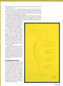
Half Page Island 115 x 191 mm.