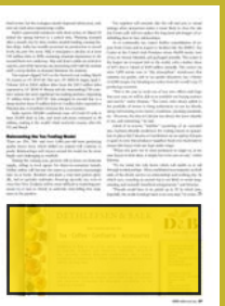
1/3 page Horizontal 178 x 83 mm.