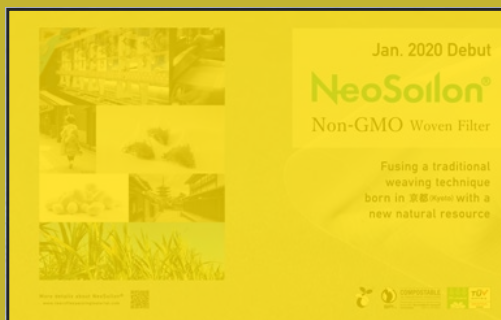
2 page Spread (full bleed) 426 x 283 mm.