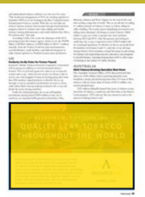
Half Page Horizontal 178 x 124 mm.