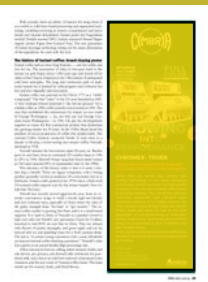
Half Page Vertical 89 x 254 mm.