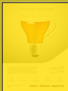
Full page Bleed 216 X 283 mm.