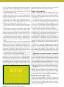
1/8 page Vertical 86 x 61 mm.