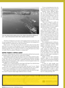
1/8 page Horizontal 178 x 35 mm.