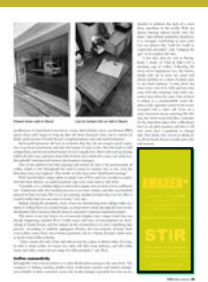
1/6 page Vertical 57 x 124 mm.