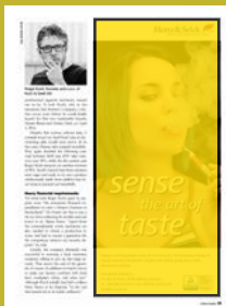
2/3 page 115 x 254 mm.