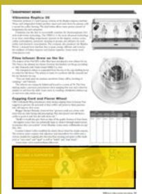
1/4 page Horizontal 178 x 61 mm.