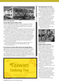
1/6 page Horizontal 112 x 64 mm.