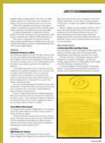
1/4 page Vertical 86 x 124 mm.