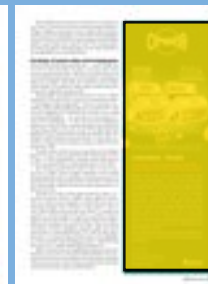
Half Page Vertical 89 x 250 mm.