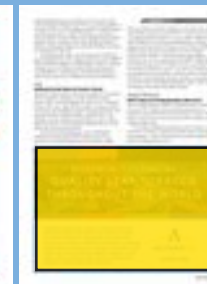
Half Page Horizontal 178 x 124 mm.