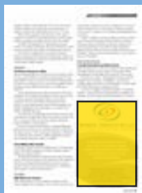
1/4 page Vertical 86 x 124 mm.