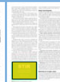
1/8 page Vertical 86 x 61 mm.