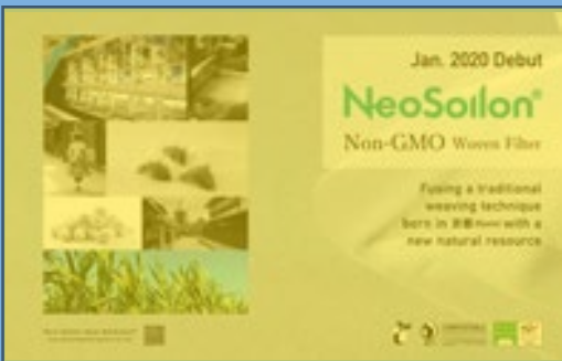
2 page Spread (full bleed) 426 x 283 mm.