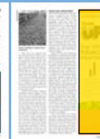
1/3 page Vertical 57 x 254 mm.