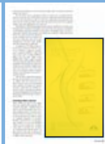
Half Page Island 115 x 191 mm.