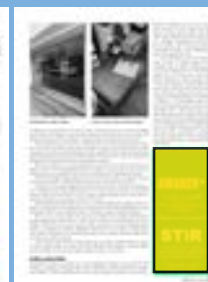
1/6 page Vertical 57 x 124 mm.