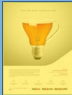
Full page Bleed 216 X 283 mm.