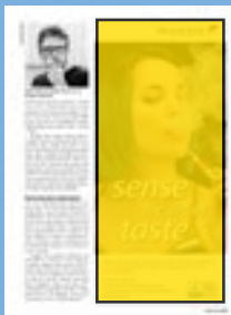
2/3 page 115 x 254 mm.