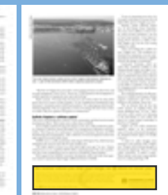
1/8 page Horizontal 178 x 35 mm.