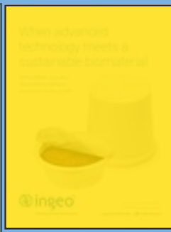
Full page Non Bleed 210 X 277 mm.