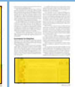
1/3 page Horizontal 178 x 83 mm.