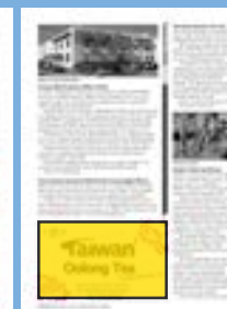
1/6 page Horizontal 112 x 64 mm.